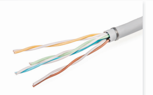
Strip the cable for minimum 75mm, pull the foil or braided shield back over the jacket an wrap the drain wire around the shield. NOTES: IDC is suitable for 22-26 AWG wires.