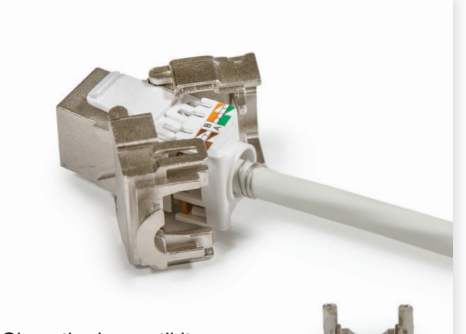
Close the jaw until it clicks into place.