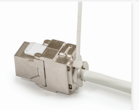
Fix the cable tie to the shielding lug.