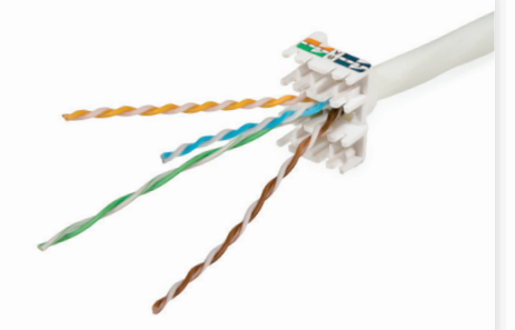
Insert the wires into the cap through the holes.