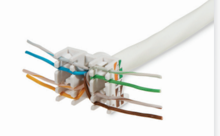
Lay the wires to their correct positions based on the color code (T568A/T568B)