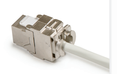
The drain wire should wrapped around the cable to ensure 360° shielded. Push the shielding lug close to the jack.